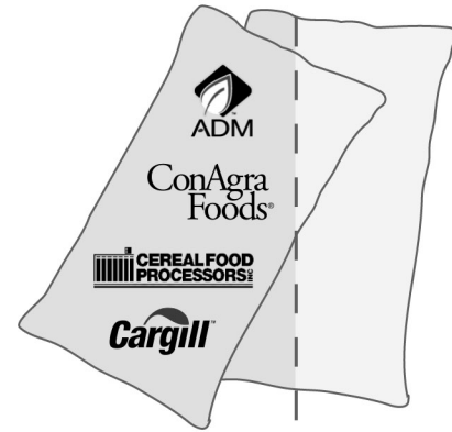
Top 4 Flour Millers 63% Up from 61% in 1990