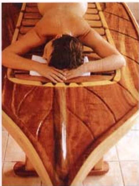
A villa on stilts, left, in Daintree rain forest; a Vichy shower table, above, crafted from local timber in the shape of an ylang-ylang leaf; the roots of a giant tree in Daintree National Park, right